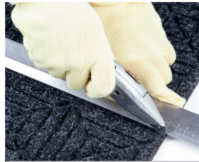
Easy cut and install